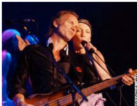
One tour that's doing well is the Sting-Annie Lennox show.